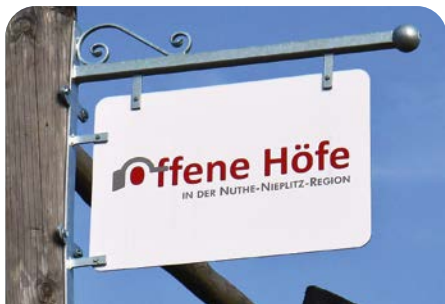
Spot the Distinctive “Offene Höfe” Sign

Diverse talents unite within the “Offene Höfe” association, encompassing the realms of agriculture, craftsmanship, art, and gastronomy. Together, these individuals farm, cultivate bees, engage in smoking, culinary expertise, milling, and the art of processing the abundant regional offerings.