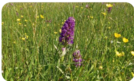
Wet Meadow with Broad- leaved Marsh Orchids

Wet meadows are adorned with broad-leaved marsh orchids, ragged-robins, and cuckoo flowers. Meanwhile, on the dry slopes, nature treats us to brightly colored gems like the Carthusian pink, fragrant scabiosa, and spiked speedwell.