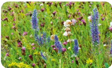
Rough Pasture with Spiked Speedwells